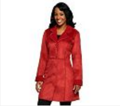
A238064 Denim & Co. Faux Suede Jacket w/ Sherpa Lining & Pockets