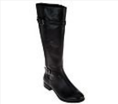
A235283 Isaac Mizrahi Live! Gored Leather Riding Boots with Buckle