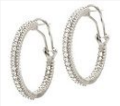
J285753 Judith Ripka Sterling or